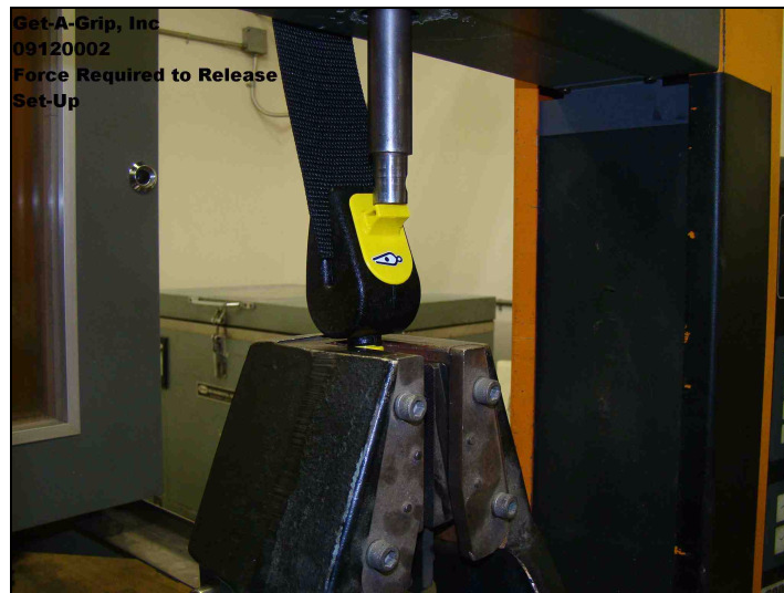
Compression Release Test (set-up photo)

Test results relate only to the items tested. This document shall not be reproduced, except in full, without the written approval of Sherry Laboratories. The recording of false, fictitious, or fraudulent statements or entries on this document may be a punishable offense under federal and state law. A2LA Accredited Laboratory Certificate No. 1089-01 (Mechanical) & 1089-02 (Chemical).